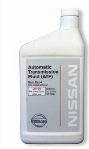
Nissan Genuine Transmatic K