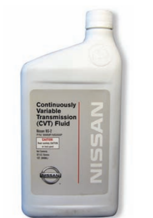
Nissan Genuine Trans CVT