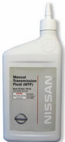
Nissan Genuine Manual Transmission Fluid