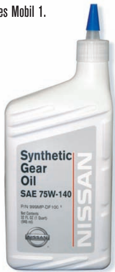
Nissan Genuine Synthetic Gear Oil