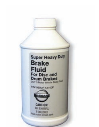
Nissan Genuine Brake Fluid