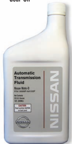
Nissan Genuine Transmatic D

If you do this before starting work on the car, you'll know the fluid type and capacity. Then, you can check stock and order if necessary so you won't accidentally install the wrong fluid in a customer's car.