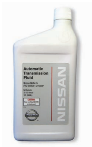
Nissan Genuine Transmatic S