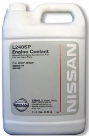
Nissan Genuine Coolant

Nissan recommends the use of Genuine Nissan 5W-30 Ester Engine Oil in 2009-2010 Maxima engines. It is also recommended for most Nissan/Infiniti vehicles 2008 MY and later. The GT-R uses Mobil 1.