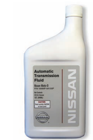
Nissan Genuine Transmatic D