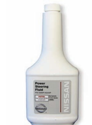
Nissan Genuine Power Steering Fluid